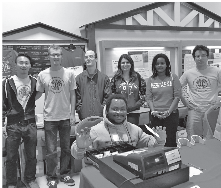
UNL's student Rotary Group, Rotaract, spent their afternoon helping at the 2015 Book Sale.