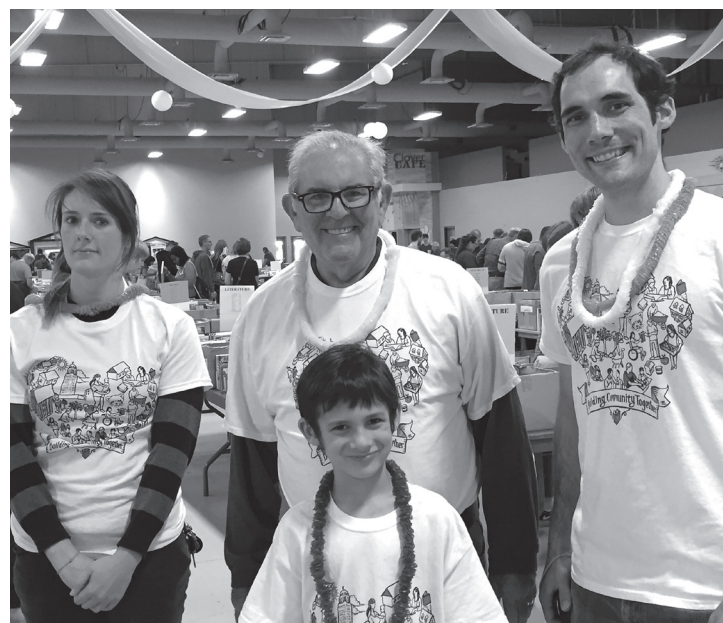
Volunteers from B & R Stores joined the fun at the 2015 Book Sale,

This is a fundraiser to benefit Lincoln City Libraries. Tickets are $40, and for Friends of Lincoln City Libraries' members $35. On October 1, tickets are $50. Your ticket will also provide you with a sandwich, chips, and a beverage to enjoy as you are search through over 100,000 books!