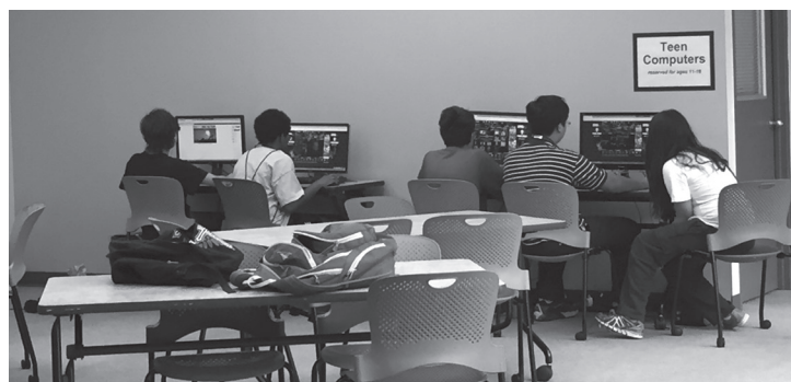
Teens at BMPL enjoying their new computers in their new space!

This space offers a distinct area for teens, dedicating one room on the main floor specifically for this age group. This space replaces the small space on the second floor. The first floor location is more accessible and inviting to the teens, has up-to-date technology equipment, and services and programs to encourage them to utilize the space. BMPL has a Teen Advisory Board which is working with staff to ensure that area teens know it's there and to create new programs to engage our teens.